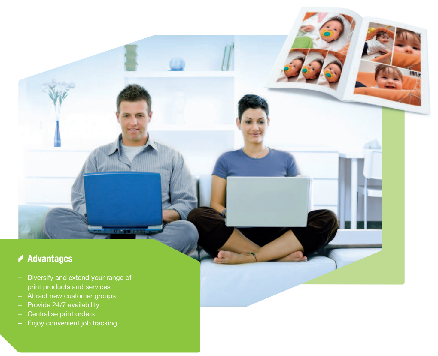
Photo book creation is an easy and attractive enhancement of your online print offering. Via a photo book application, you provide your customers with easy yet extensive online layout possibilities to create albums or calendars with their photos of holidays, events and other occasions. Similar to other web-to-print applications, photo book software includes online submission, payment and tracking, right down to the final delivery or collection of the printed photo book.